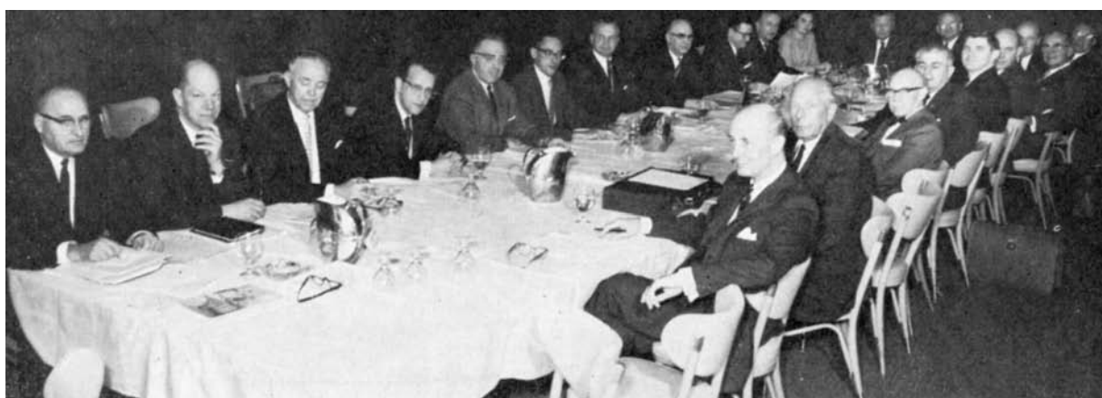
Figure 20. Joint meeting of the ACA Council on Education and the Council of State Chiropractic Examining Boards during the midyear meeting of the ACA board of governors; from the February 1964 issue of the ACA Journal of Chiropractic.