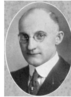
Figure 3. Dr. Arthur Forster, circa 1918.

nonallopathic) healers (see Table 1). When a few BSBs accepted the test results of the National Board