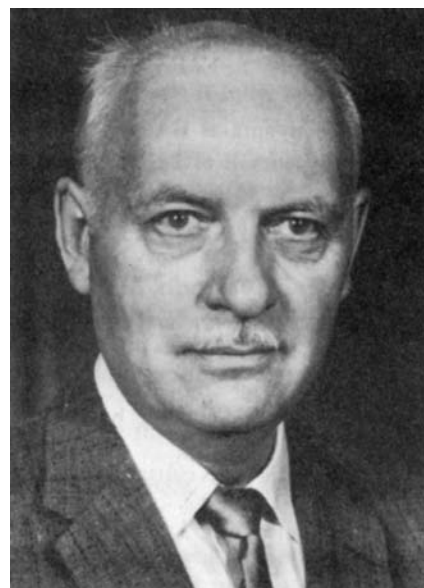
Figure 16. Dr. Major B. DeJarnette of Nebraska.

The National Board of Examiners met in Detroit and adopted the following policies: